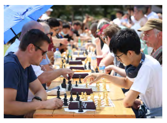
Check out all the Summer plans at Liverpool ONE by visiting www.liverpool-one.com or by downloading the Liverpool ONE MyONE App.

Soak in the atmosphere on sunny days at ChessFest and Liverpool Sketching Day: watch the pros do what they do best, or have a go yourself! Enjoy a full day of chess activities on Chavasse Park on Sunday 16 July, or turn up with sketchbook in hand and be inspired by Liverpool ONE's architectural surroundings and green spaces on 5 August.